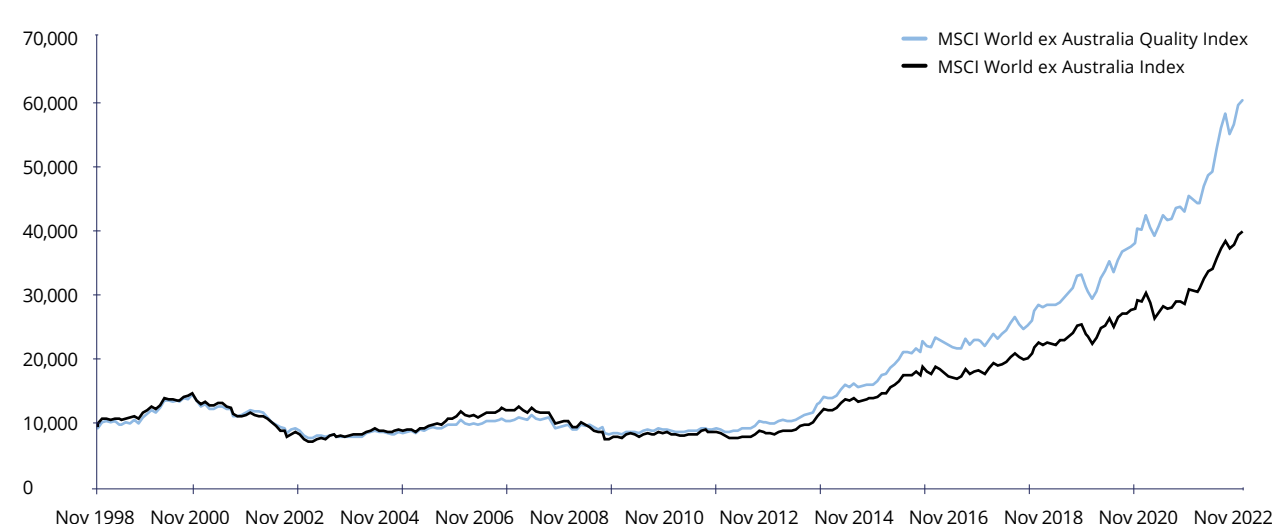
Chart 2: Growth of 10,000: MSCI World ex Australia Quality Index and MSCI World ex Australia Index

Source: Morningstar Direct, as at 31 January 2022. Past performance is not a reliable indicator of future performance. The above graph is a comparison of performance of MSCI World ex Australia Quality Index (QUAL Index) and the parent index, based to 10,000 from 30 November 1998. Results are calculated to the last business day of the month and assume immediate reinvestment of all dividends and exclude fees and costs associated with investing in VLUE You cannot invest in an index. QUAL's Index base date is calculated at 30 November 1994. QUAL Index performance prior to its launch on 15 October 2014 is simulated.