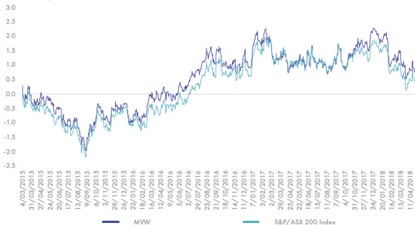
Chart 3. Sharpe Ratio: MVW vs S&P/ASX 200

Results are calculated daily to the last business day of the month and assume immediate reinvestment of all dividends. MVW results are net of management costs but do not include brokerage costs of investing in MVW. Performance on is not a reliable indicator of future performance.